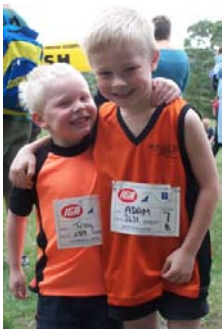
The Maggs brothers

"Cross Country results and photos are also placed on our club webpage weekly"