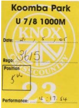
Cross Country Result ticket

Lardner Park is just over a 30 min drive and located between Drouin and Warrigal with the park entry off Burnt Store Road. Appropriate signage will be displayed to the precise gate.