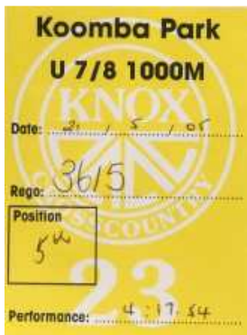
Cross Country Result ticket

Arrangements have been made for Little Athletics to use the "North Gateway" entrance off Colwells Road where parking is $5 per carload. The main entrance to Hanging Rock is $8.